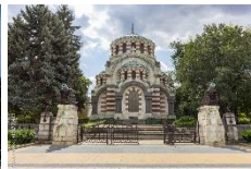
St George the Conqueror Chapel Mausoleum

Pleven is the seventh most populous city in Bulgaria, the administrative centre of Pleven Province, and the largest economic hub of Northwestern Bulgaria. With a population of approximately 90,000 (2021 census), it is an important cultural, scientific, and historical centre.