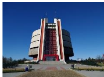
Panorama "Plevn Epic 1877"